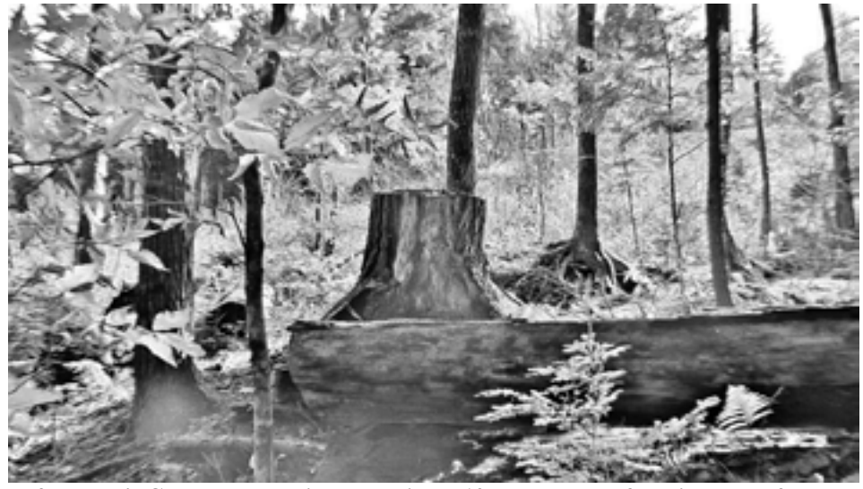
Tuftonboro's Great Meadow is located in a 512-acre parcel of undisturbed, forested land.

Brook trout who have struggled through the spring melt begin feeding on the abundant insects produced in spring. They struggled because the snow accumulation is acidic from power plant and vehicle exhaust emissions. It melts all at once releasing an acidic shock. The acidic compounds block their gills, so it is hard for the fish to breath. The water is teeming with insect larvae changing into flying adults that will lay eggs in the water to start the process all over again. Abundant sunshine encourages algae and